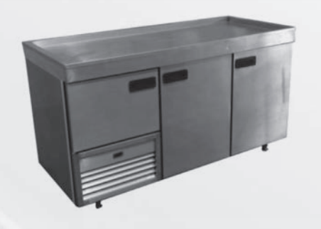
POLAR-TOP WITH UNDERBAR REFRIGERATOR