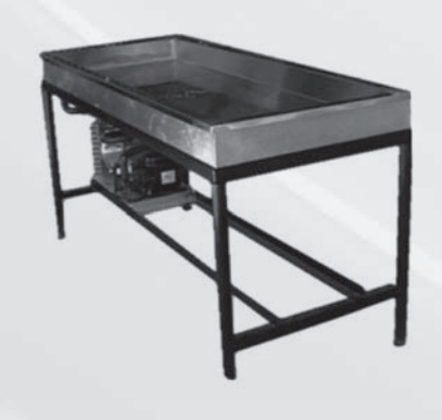
POLAR TOP WITH MILD STEEL STAND

ALL UNITS AVAILABLE IN 650mm WIDE OR STANI ALONE TOP UNITS MADE TO ORDER