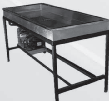
POLAR TOP WITH MILD STEEL STAND