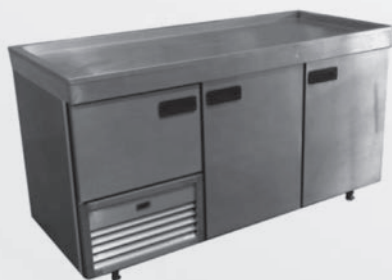
POLAR-TOP WITH UNDERBAR REFRIGERATOR